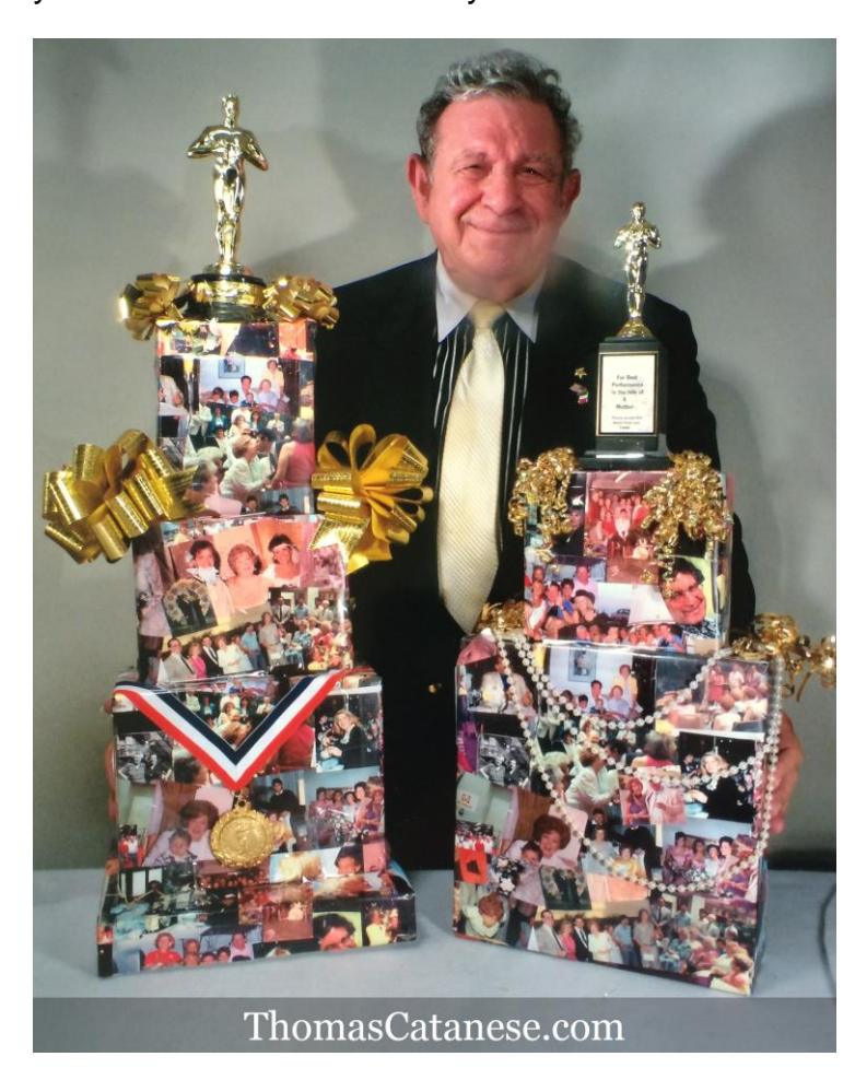
This Gift set of 5 boxes stacked on top of each other is 40" tall!

You will need to spend about 3 to 4 hours to create this very important Gift for your Mother on Mother's Day! Start now!